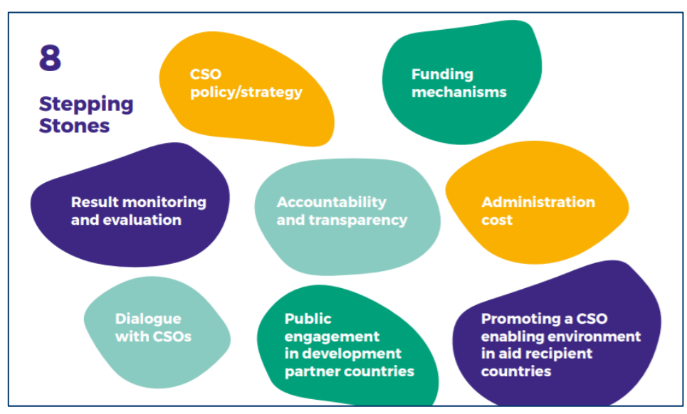
Part 3. Official Development Cooperation with CSOs

In relation to Official Development Assistance (ODA) support to civil society, the following main lessons appear: