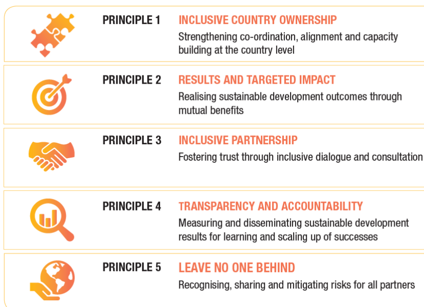
Figure 3: The Kampala Principles

The assessment will be an integral part of the GPEDC monitoring exercise. As agreed in the 21 st Steering Committee, it will integrate and replace the framework’s Indicator 3, which measured the quality of public-private dialogue. It will, as such, be a more comprehensive assessment of effective private sector engagement in development co-operation – looking beyond public-private dialogue to measure how to engage effectively with the private sector as part of development co-operation . As it focuses on the practicalities of partnerships with the private sector, it is unique and focuses on issues not covered in any other global monitoring exercise, notably how private sector engagement explicitly benefits those who are furthest behind.