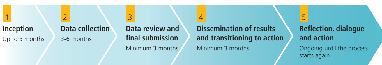
FIGURE 1 | WHAT THE MONITORING LOOKS LIKE AT THE COUNTRY LEVEL AND APPROXIMATE DURATION

Note: See Part 2 for a more detailed presentation of the monitoring process.